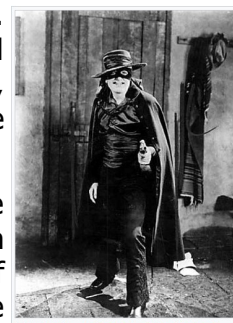
Fairbanks as Zorro in The Mark of Zorro (1920)