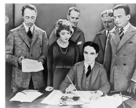
D. W. Griffith, Mary Pickford, Charlie Chaplin (seated) and Fairbanks at the signing of the contract establishing